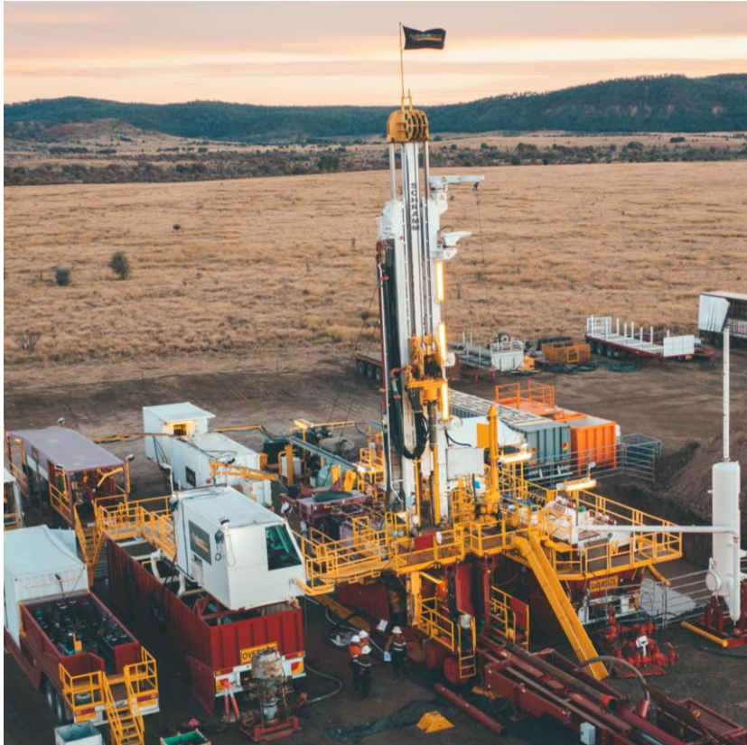
Silver City Rig 23.

Drilling is expected to commence in mid-April and all necessary long lead items have been ordered with several items already in storage on site. Planning is underway to construct the electrical, gas and water gathering systems for the five new production wells. All long lead items have also been ordered for the surface facilities, pipeline and electrical network.